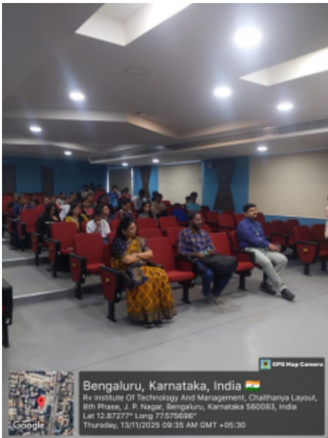
Department of Computer Science & Engg.