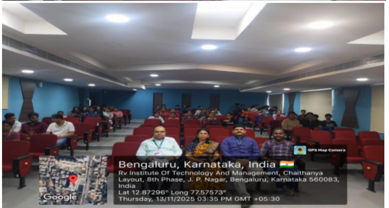
Coordinator's Signature Dean's Signature HOD's Signature Department of Computer Science & Engg. Page 6