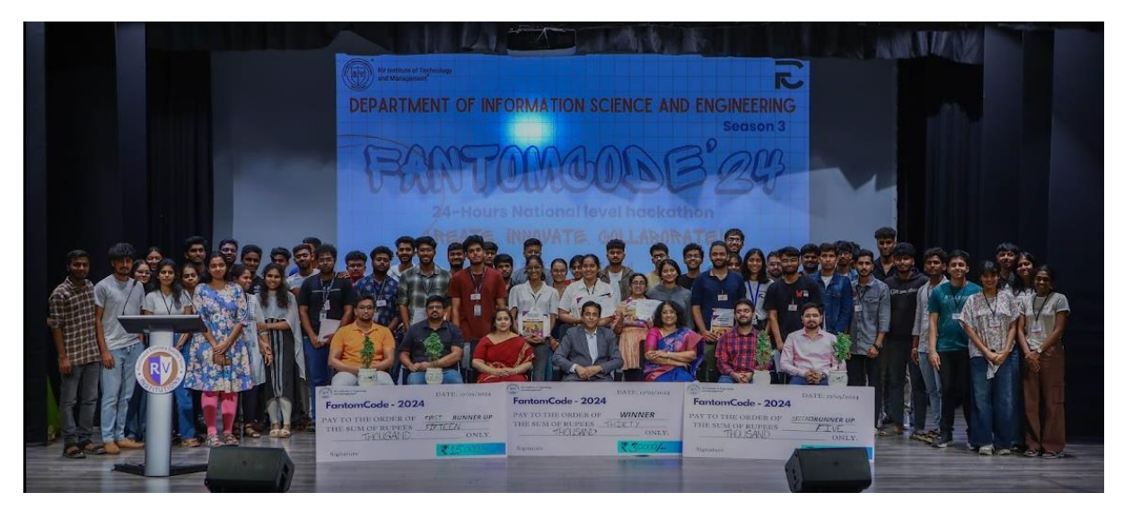
Participants and Volunteers of FantomCode 2024