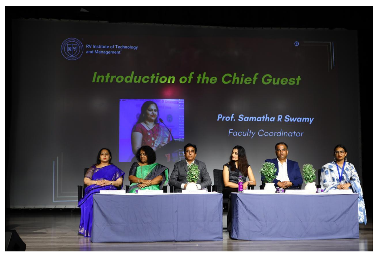
Inauguration Function of FantomCode 2024