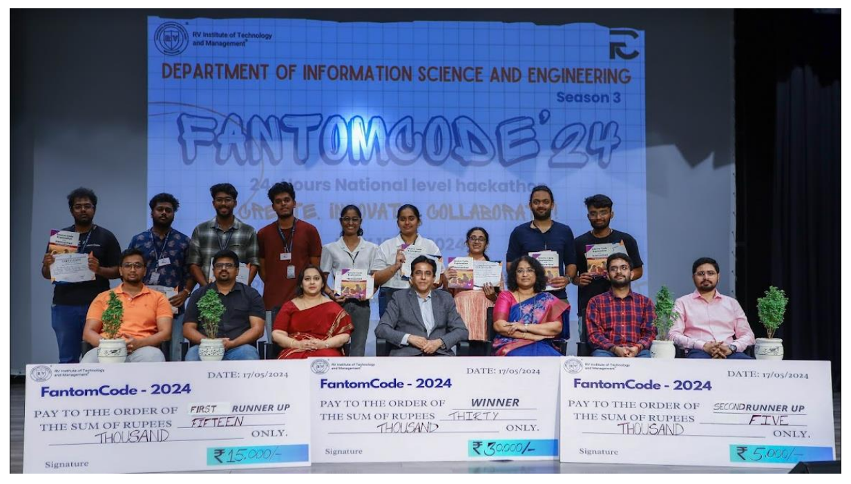
Winners of FantomCode 2024