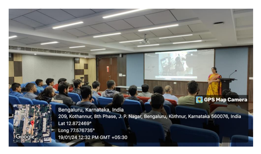
NDLI Speaker with Audience