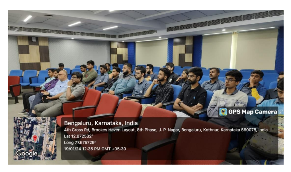
Faculty, Staff and Audience