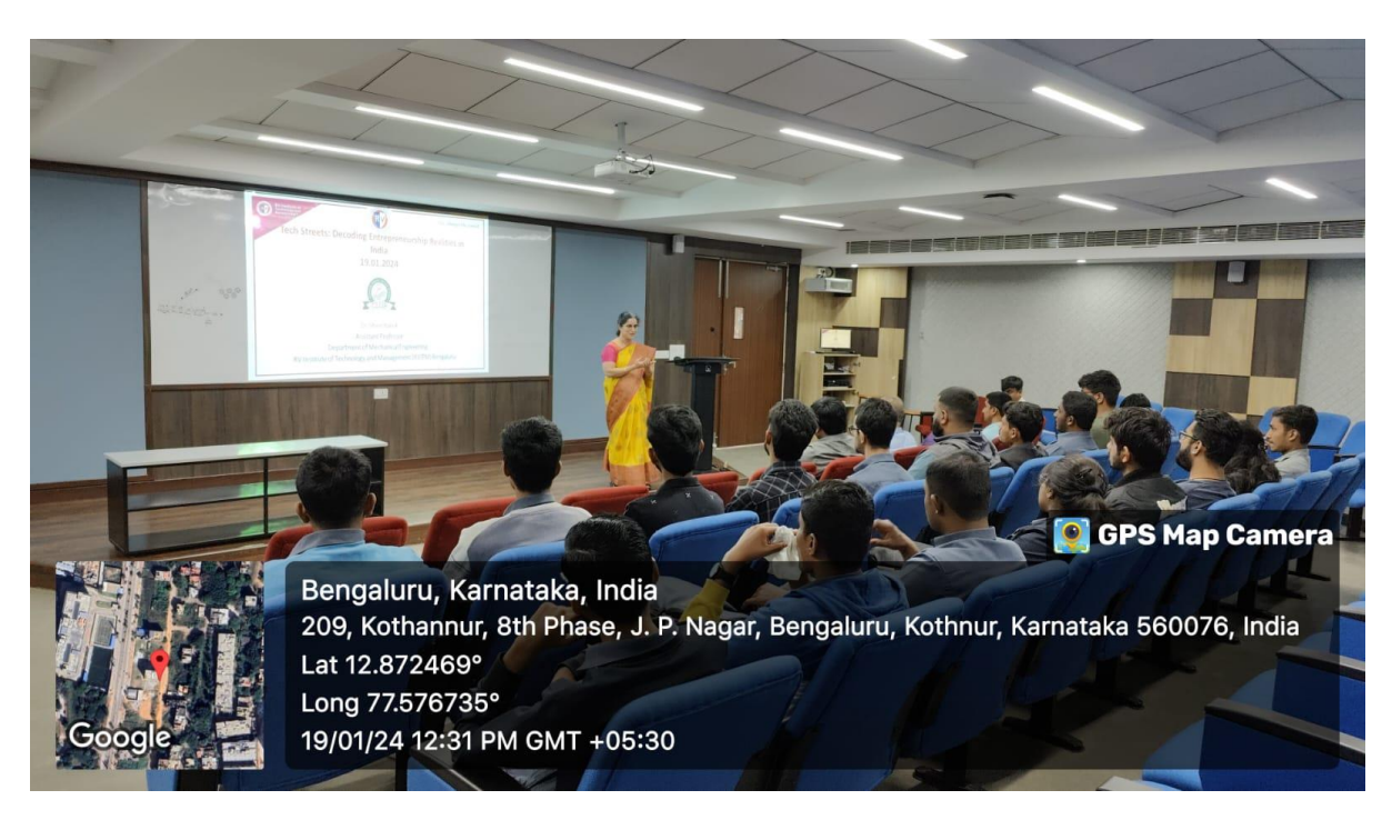
NDLI Speaker with Audience