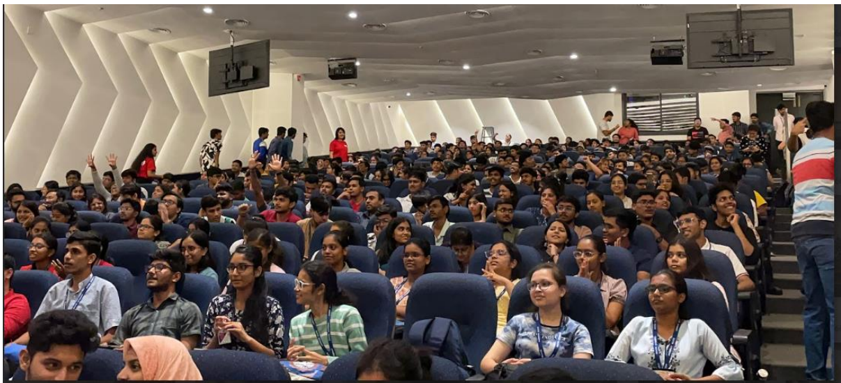
Students interaction with U & I Team