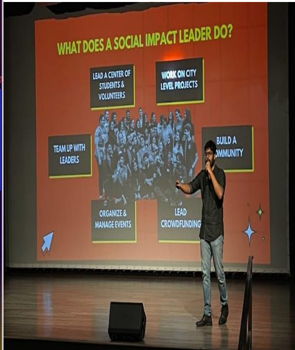
Key topics by Resource person