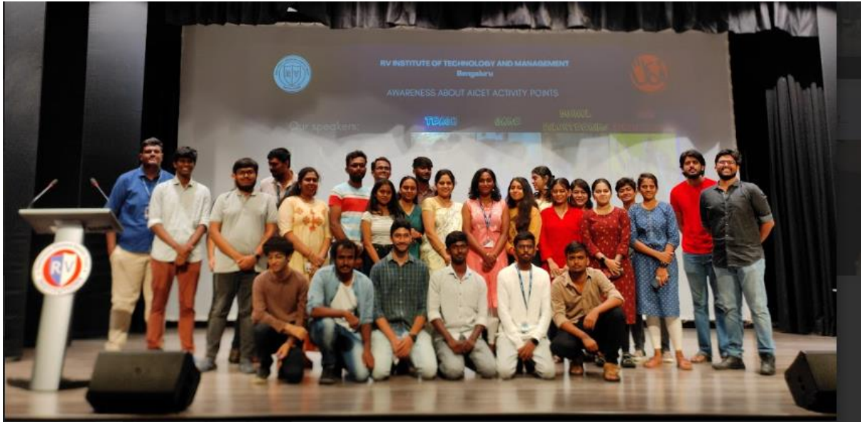
Event Organisers team