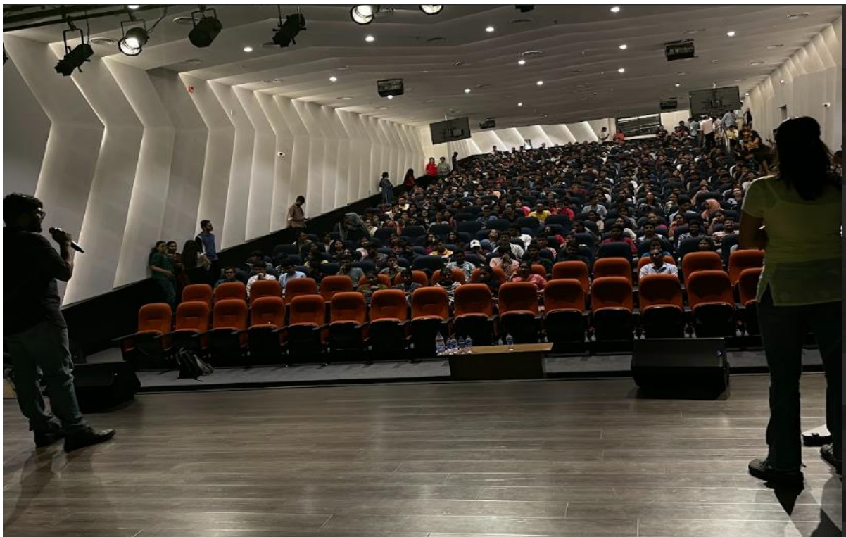
U & I Activities explanation to students