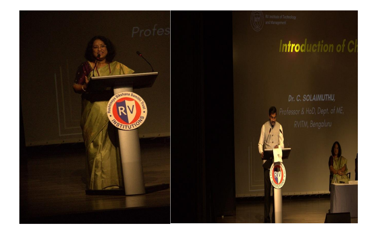
WELCOME ADDRESS BY ISE HOD.